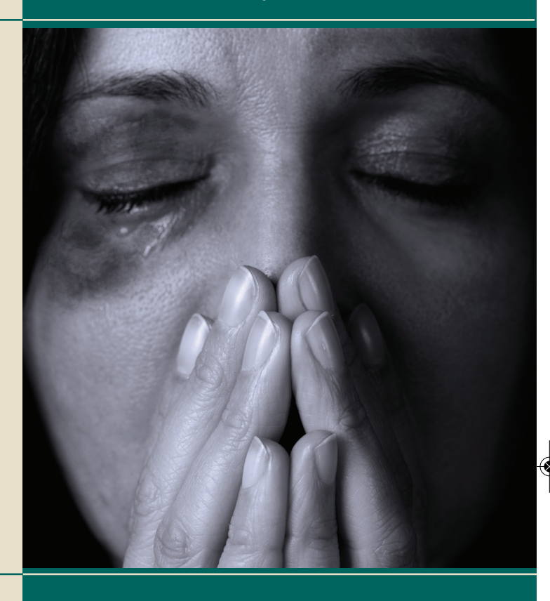
Requirements For Healthcare Workers